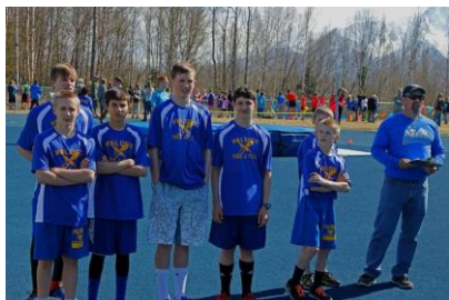
Pictured above: Gilson Middle School track athletes at their meet last week in Palmer

Question #1 - CLICK HERE to read Candidates Answer to the Following Question, What experience do you have with budgeting, investments, and finance?