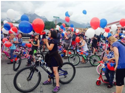
Pictured above: Kids in the Decorated Bike portion of the 4 th of July parade

The intensive also includes classes in Acting, Dance, Stage Combat, Voice, Improvisation and much much more. The academy is open to students 8-18.