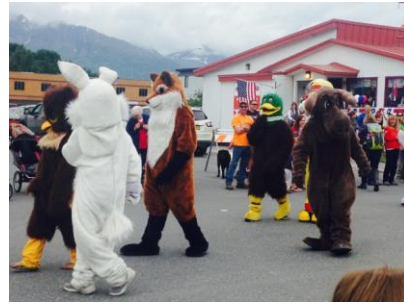
Pictured above: The Valdez mascots in the 4 th of July parade