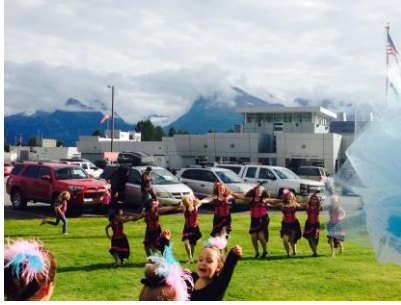
Pictured above: The Valdez Kickers performing at the Ice Cream Social and Cupcake Wars