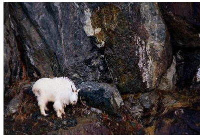
Pictured above: A mountain goat seen on a Stan Stephens Cruise

First National Bank Alaska (pictured above) was the 2015 Gold Rush Days Business Winner for best decorated business.