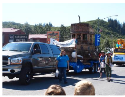
Pictured above: The Valdez Museum parade float