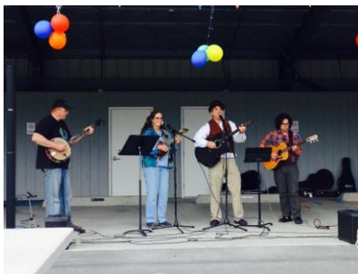
Pictured above: Local Band playing during the Gold Rush Ice Cream Social and Cupcake Wars