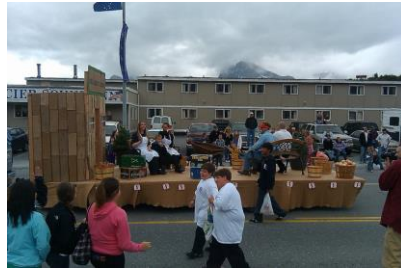
Pictured above: A float from the 2013 Gold Rush Days Parade

The annual Gold Rush Days parade is scheduled for Sunday, August 2nd at 3pm on Egan Street. This year's theme is "Go Take a Hike." If you would like to be a part of this years parade, CLICK HERE to download a registration form. Line up for the parade will begin at 2PM at the corner of Egan Dr. & Hazalet on the day of the parade.