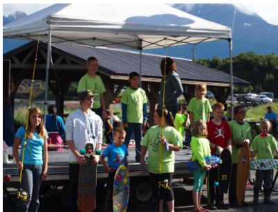
Pictured above: 2015 Kids Derby division winners

All meetings of City Council and School Board are held in City Council Chambers, broadcast on 1230AM KVAK and streamed LIVE on www.kvakradio.com