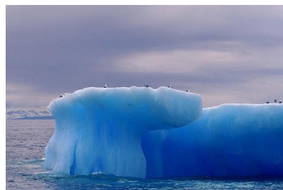
Pictured above: An iceberg from Columbia Glacier taken during a Stan