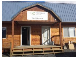
FOOTHILLS DENTISTRY OPEN FOR

The City of Valdez recently commissioned the McDowell Group to put together a competitive market analysis and long range planning for the Port of Valdez. The survey indicates Anchorage has 84 percent of the estimated market share of Southcentral Non-Petroleum, Non-Coal Freight Volume in the state, followed by Whittier with 11 percent, Seward with 3 percent and Valdez with 2 percent. The study, among other things, predicts an increase in out-bound shipments of salmon with the expansion of Silver Bay Seafoods' expansion of their Valdez seafood processing facility. CLICK HERE to access the study.