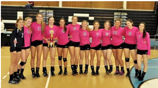
VHS Girls Volleyball Team Wins Invitational