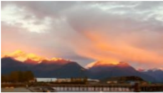
Valdez Sunset