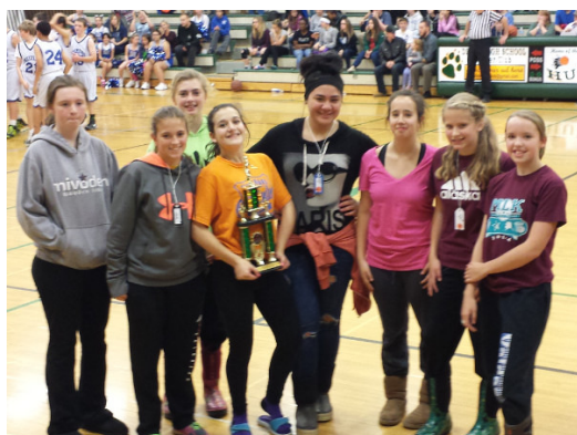
Gilson Middle School Girls Basketball 2nd Place Delta Invitational