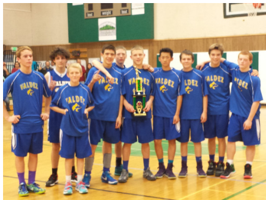
Gilson Middle School Boys Basketball 1st Place Delta Invitational