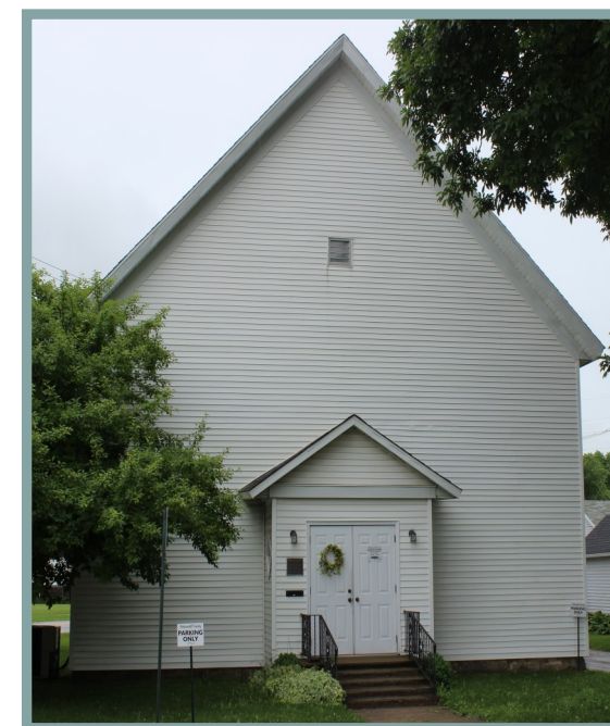
Jasper Co. Historical Society Museum

The museum building shown below was built by the Free Will Baptist Church and sold to the Methodist Protestants in 1902. It remained their property until 1916. Although after Helenor's time, its significance in the history of the Methodist Protestant Church justifies its inclusion in the proposed United Methodist Heritage Landmark.