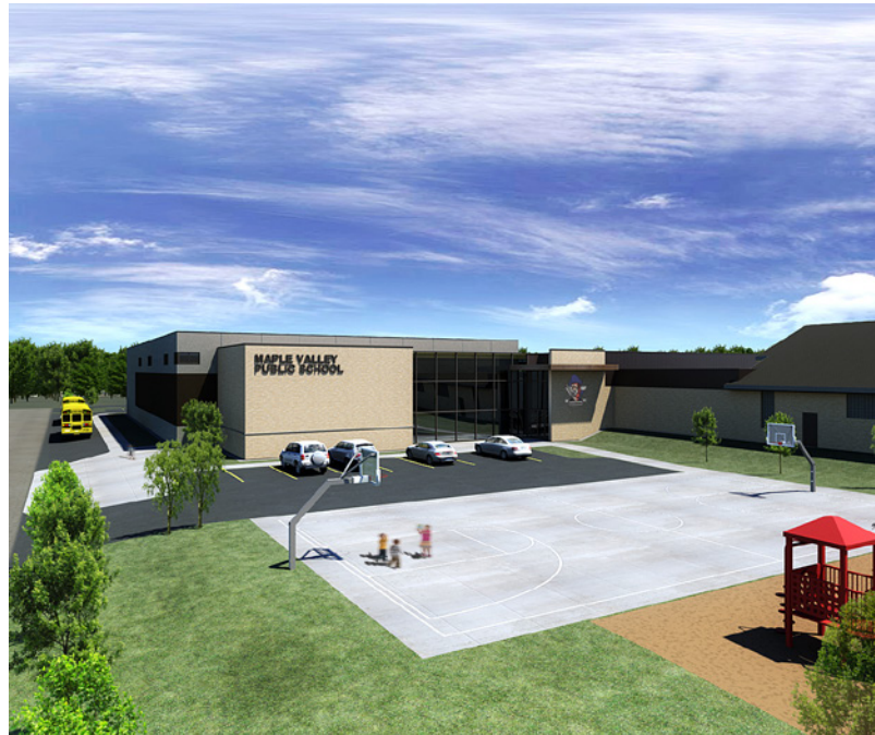
Maple Valley Public School North Entrance Rendering by ICON Architectural Group