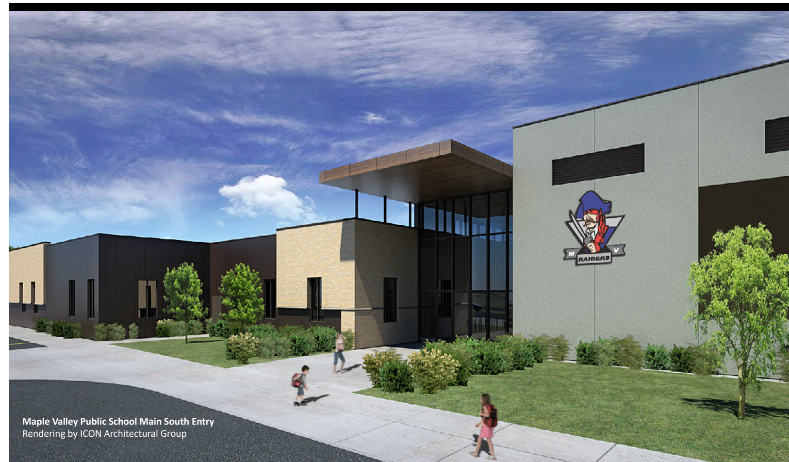
Maple Valley Public School Main South Entry Rendering