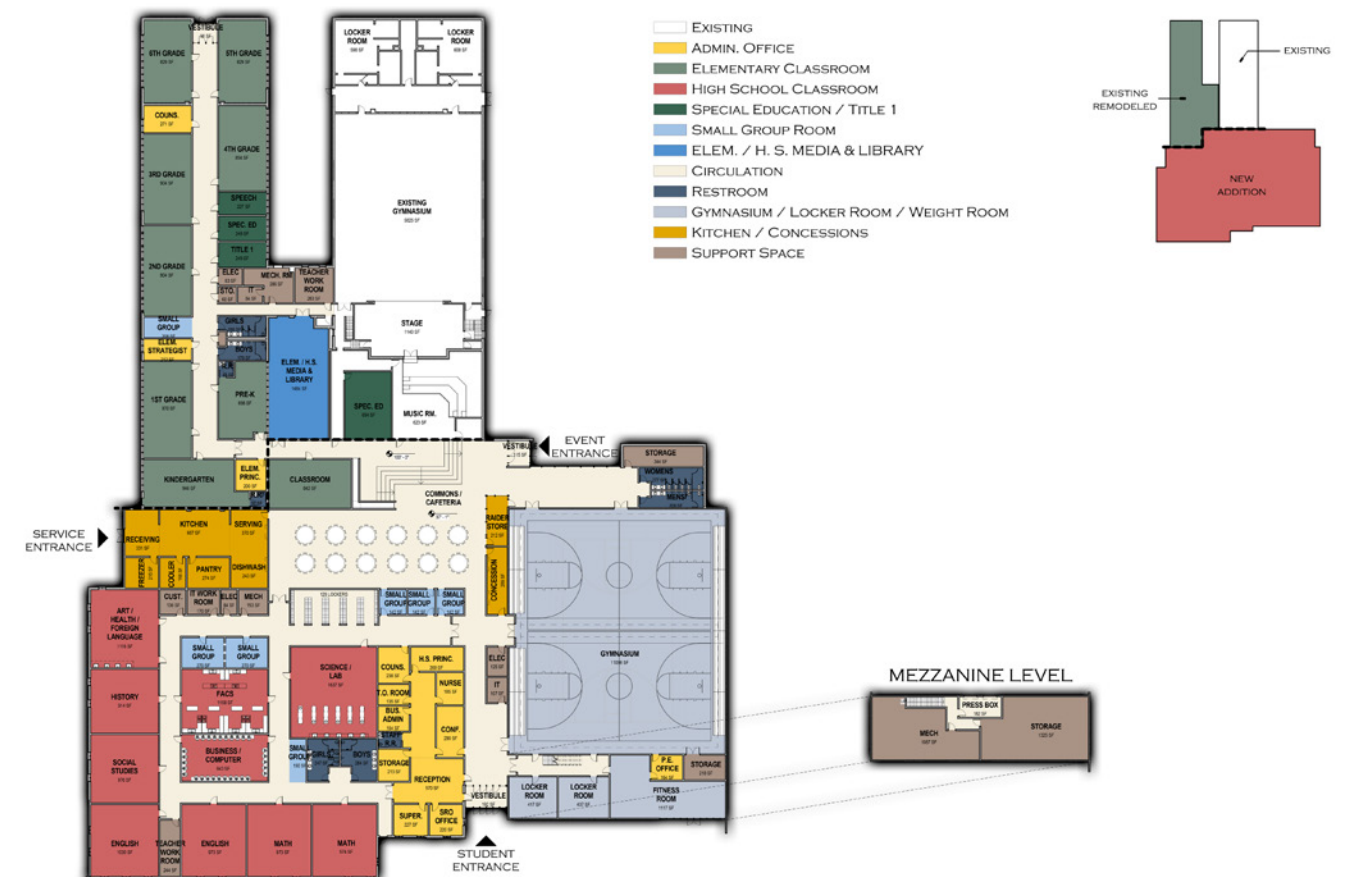
Maple Valley Public School Site and Floor Plans by ICON Architectural Group