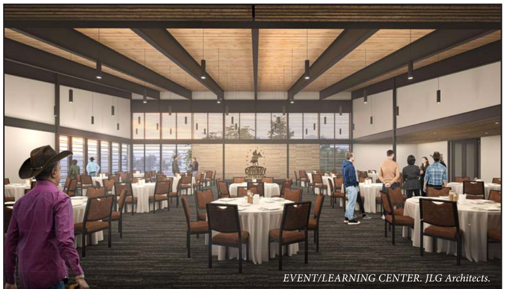
EVENT/LEARNING CENTER. JLG Architects.

In the all-new, reimagined Hall of Honorees, the use of technology allows us to in essence return all of our Inductees to the walls. Thirteen large, high-definition, vertical display monitors - one for each induction category - would be installed. Each inductee would appear on the display for several seconds, in their category, in a slow loop. Timing for the change in each display would be offset, creating gentle, pleasing motion around the room. Displays would