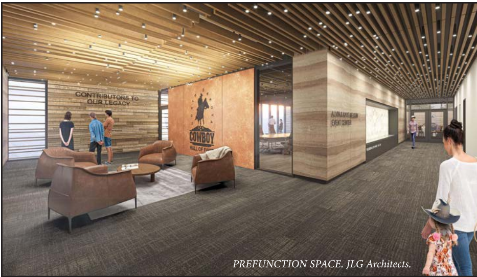
PREFUNCTION SPACE. JLG Architects.