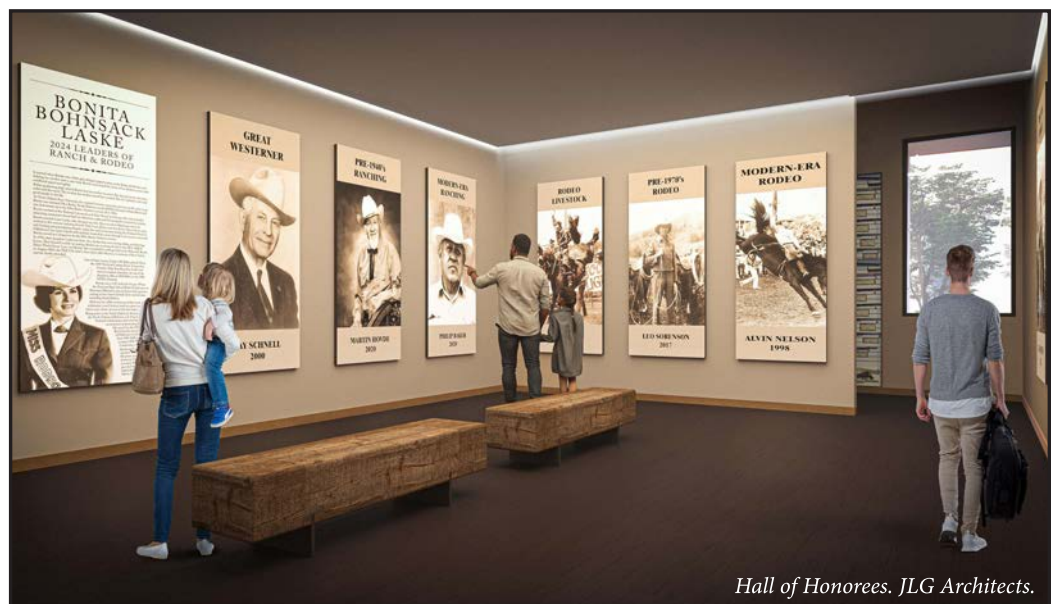
Hall of Honorees. JLG Architects.

On these pages, we present floor plan concepts for both levels of our building, along with preliminary renderings that provide an idea of what our improved facilities might look like. Corresponding narratives provide a brief look at preliminary concepts for each area including, but not limited to, guest experiences, increased and upgraded event, conference and educational space for our own use and for facility rental income opportunities, archive space for more thoughtful and intentional curation of art and artifacts, and reconfiguration of staff workspaces for improved workflow and efficiency.