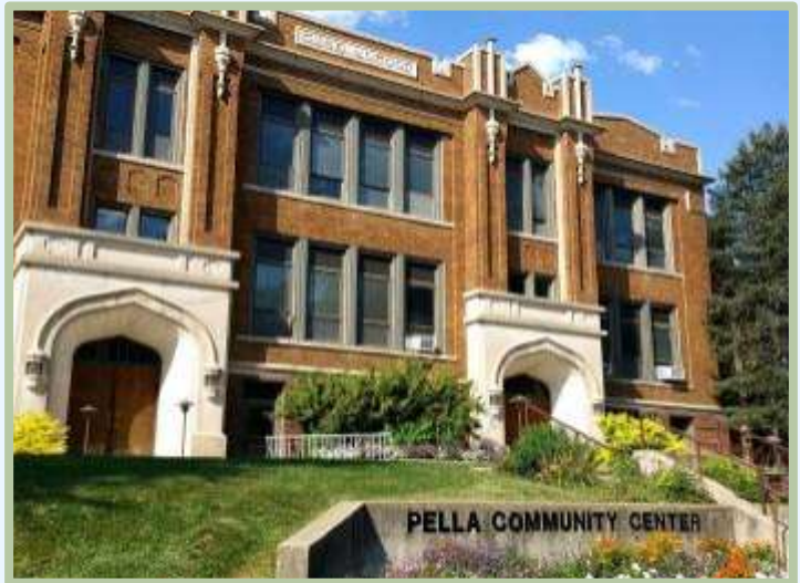
Pella Community Center, 712 Union, 641.628.4571

The City of Pella provides many recreational opportunities for youth and adults alike. From open green spaces that allow you to create your own way of play, to structured sports programs for teams, the Community Services Department will meet your recreational needs.