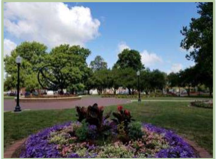
Parks Maintenance, 641.628.4299