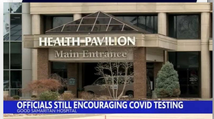
OFFICIALS STILL ENCOURAGING COVID TESTING GOOD SAMARITAN HOSPITAL