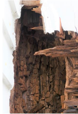
Northeast corner post of tower at ground floor