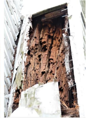
Northeast corner post of tower at gallery level