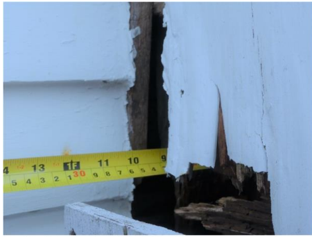
Depth of decay at northwest corner post, ground floor