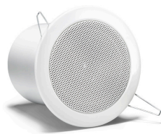
Direct Fired Tangent

Both methods are very common and effective in the sound masking industry.