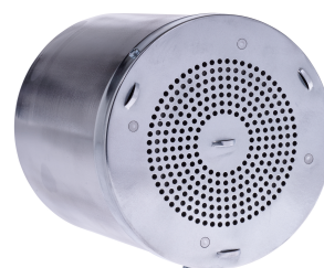
Gold In-Plenum Universal