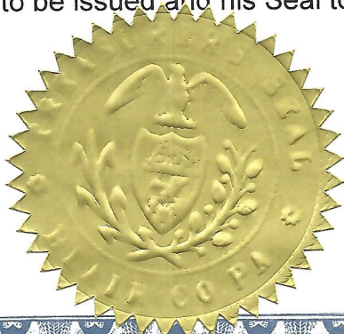
Blair County Deputy Treasurer

IN WITNESS WHEREOF : The Treasurer of Blair County has caused this permit to be issued and his Seal to be affixed on this the 22nd day of March, 2021.