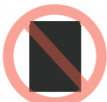
Colored plastic storage bag