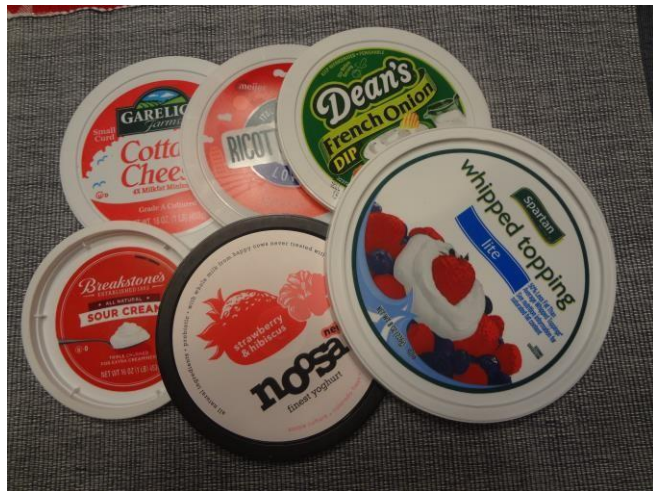
Cottage Cheese, Sour Cream & Cool Whip Container Lids