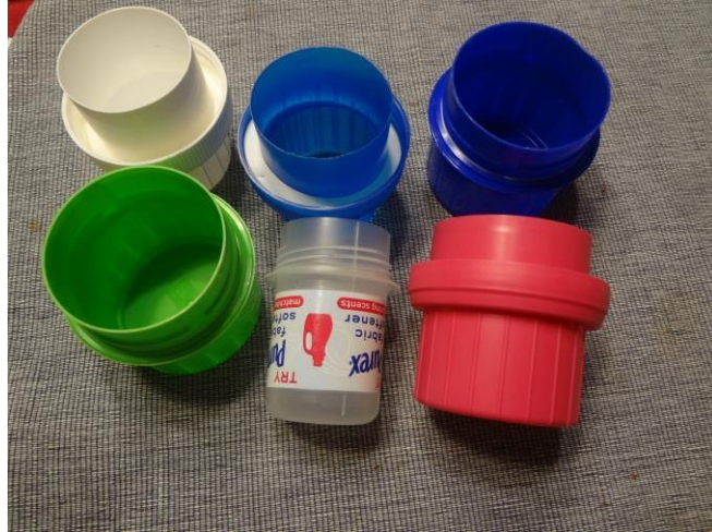
Detergent Caps with white gasket and label removed