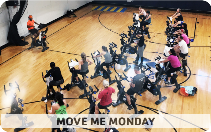
MOVE ME MONDAY