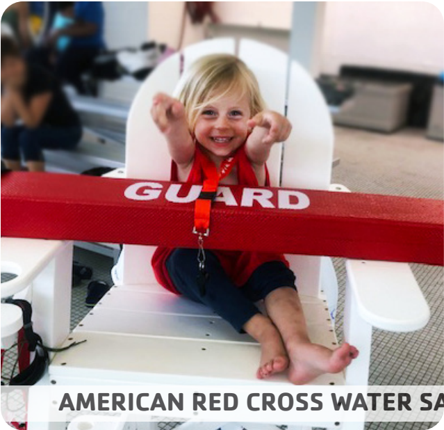
AMERICAN RED CROSS WATER SAFETY MONTH CELEBRATION