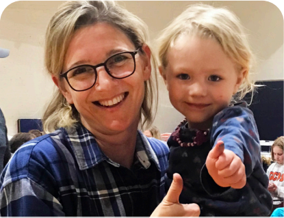
"TURKEY BINGO" MEMBERSHIP GATHERING